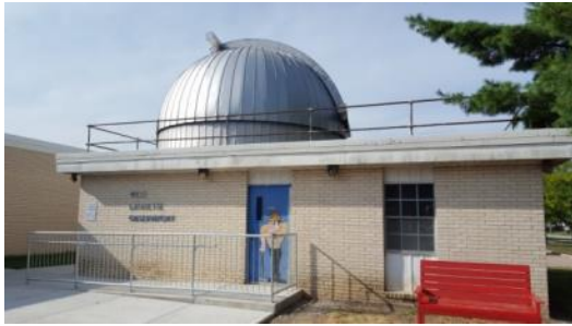
West Lafayette Observatory East side of West Lafayette Elementary School 600 Cumberland Ave. West Lafayette, IN

Observatory Information: 16", 13", 10", and 8" diameter telescopes, Lunt LS60TH \alpha solar scope.