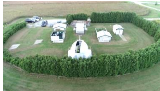
Prairie Grass Observatory at Camp Cullom Observatory Information: 28" Starmaster telescope, 16" Meade LX200R telescope, 7" Meade ED APO refractor telescope, 100 mm binoculars on universal mount, warming room w/ DSL internet.